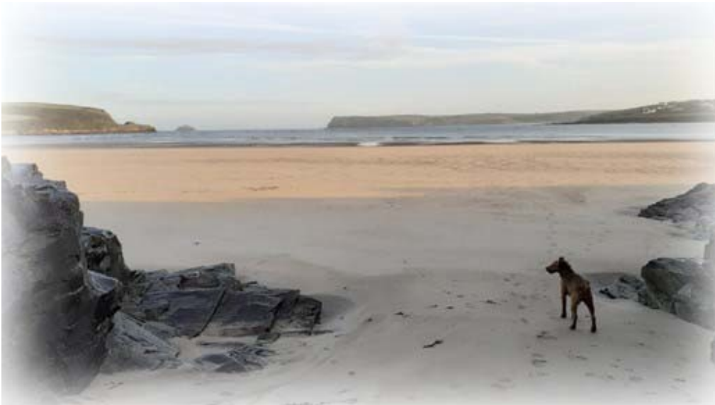
Eddie on Tregirls Beach