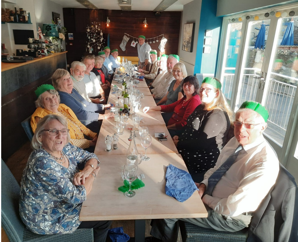
Club Christmas lunch at Stepping Stone