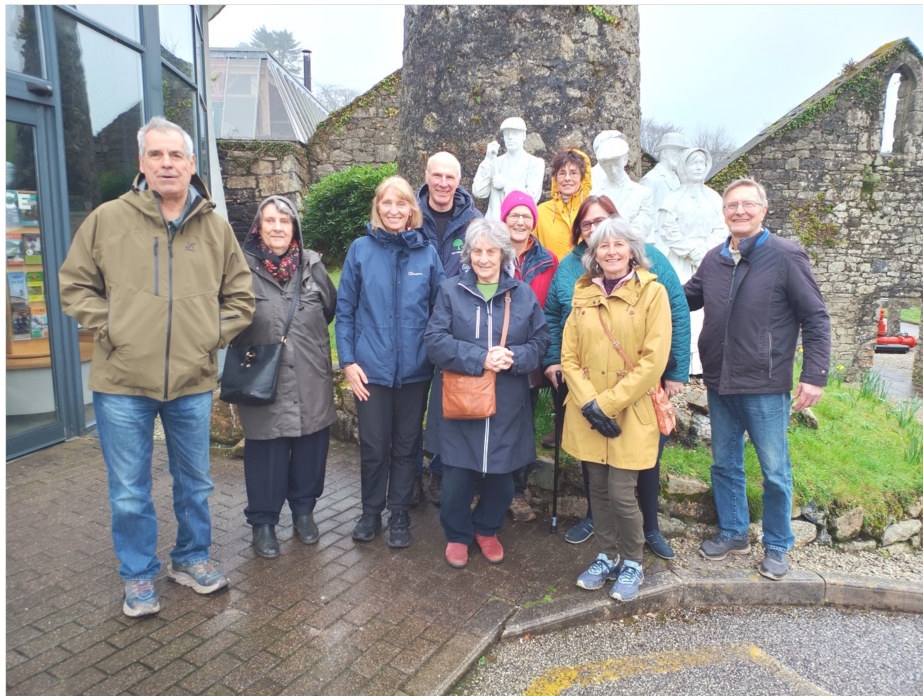
Withiel WI plus. Wheal Martyn