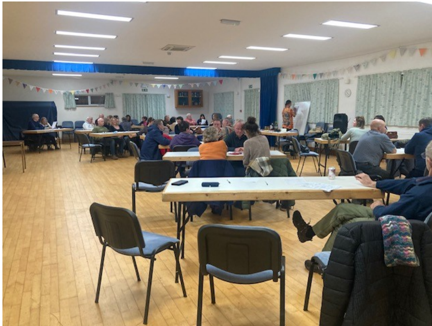
Taking a well earned break in the quiz